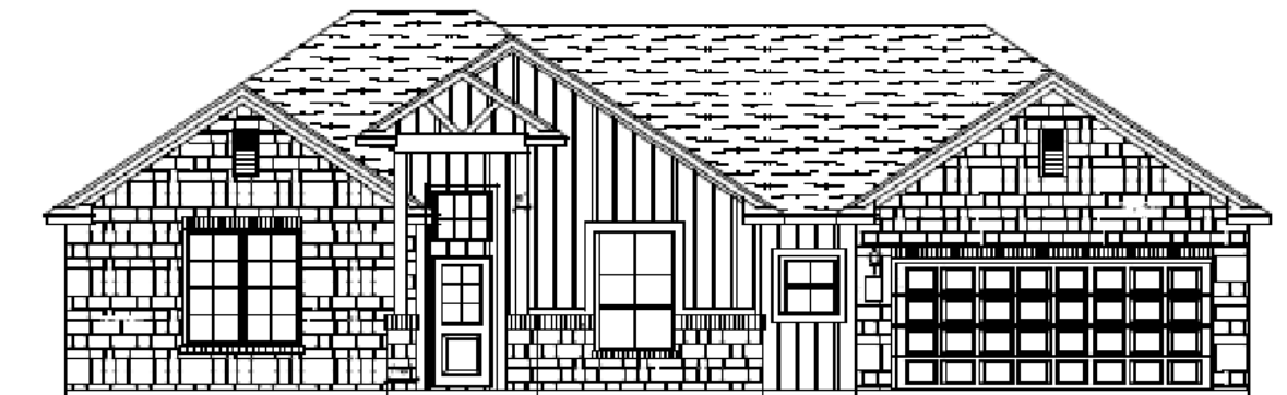
FRONT ELEVATION "D"

Brochure plans are artist depictions and may vary from actual plan. Square footages, room dimensions, prices, specifications, options, materials and availability of homes by community may vary and is subject to change without notice.