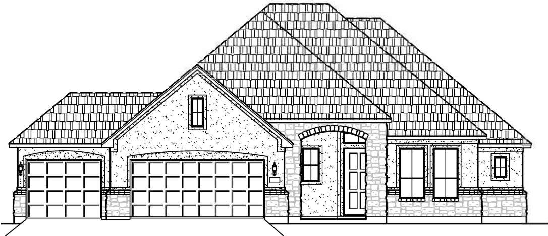
Front Elevation 'B'

Brochure plans are artist depictions and may vary from actual plan. Square footages, room dimensions, prices, specifications, materials, and availability of homes by community may vary, and are subject to change without notice.