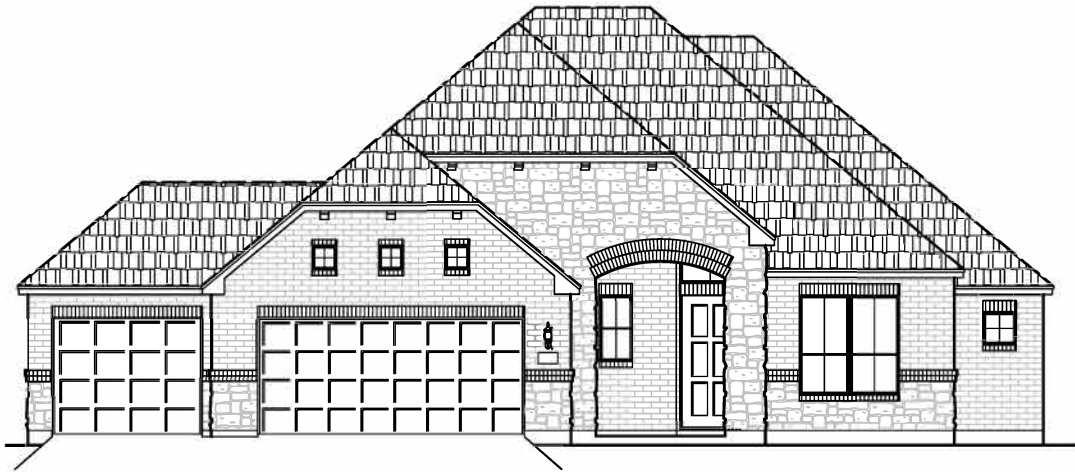
Front Elevation 'A'